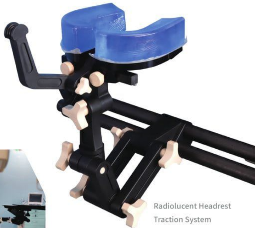
Radiolucent Headrest Traction System