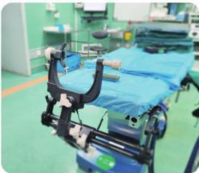
The standard fixation with OT table

Made of polymer material. Protect the pins tip when sterilizing.