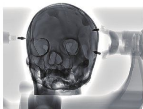
HUIDAMED Skull Clamp under Fluoroscopy version