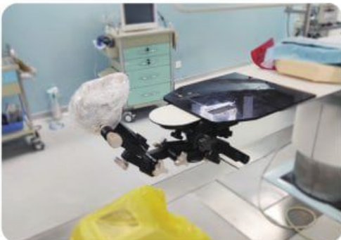
Could provide connect solution for different DSA table